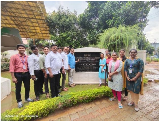
Inauguration stone @ HAL