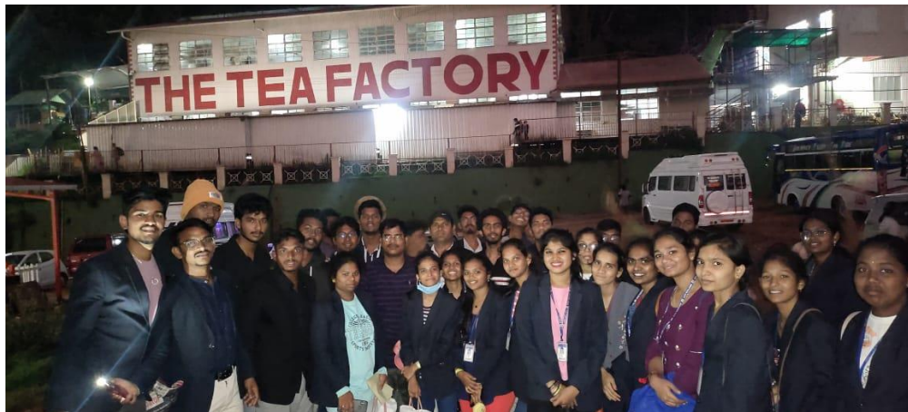
Tasting Sample tea @ Bench Mark Tea factory, OOTY